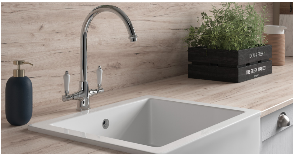
Lamona Broadstone Open-Fronted Sink