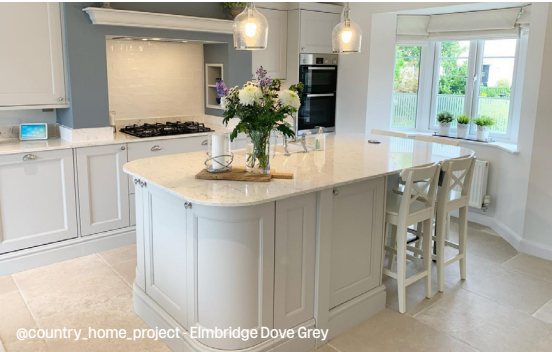
@country_home_project - Elmbridge Dove Grey