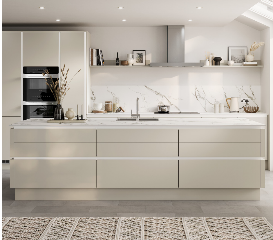
Hockley Super Matt Sandstone Handleless