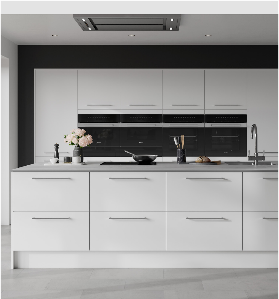
Hockley Super Matt White