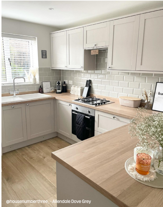
@housenumberthree - Allendale Dove Grey