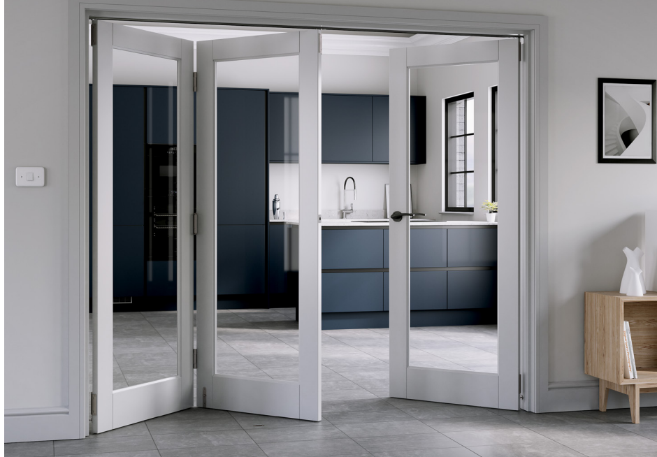
Primed Pattern 10 Glazed Roomflex Pro Room Divider