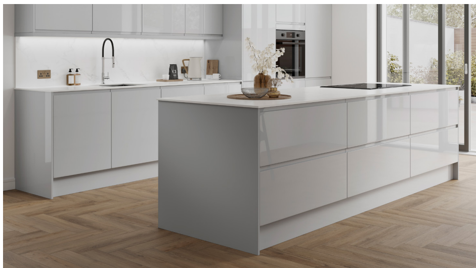
Clerkenwell Gloss Dove Grey