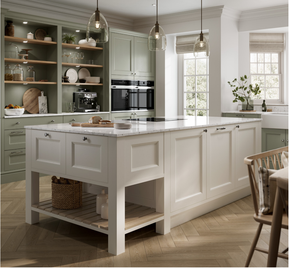
Elmbridge Sage Green and Porcelain