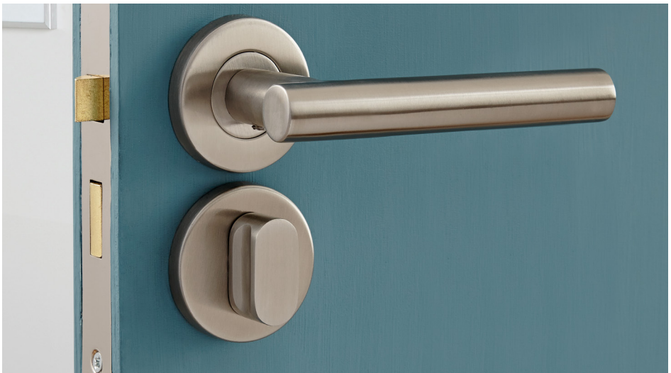
Lecco Satin Stainless Steel Door Handle