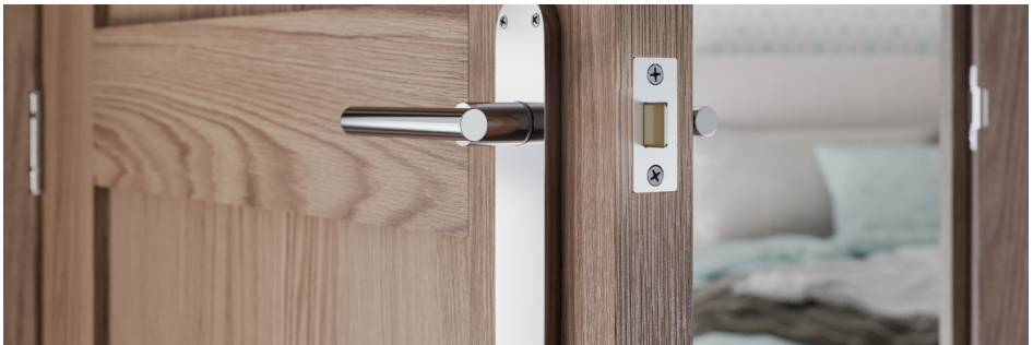
Cesano Polished Chrome Latch Door Handle