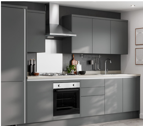
Greenwich Matt Slate Grey Handleless

Traditional values and trade quality are at the heart of everything we do.