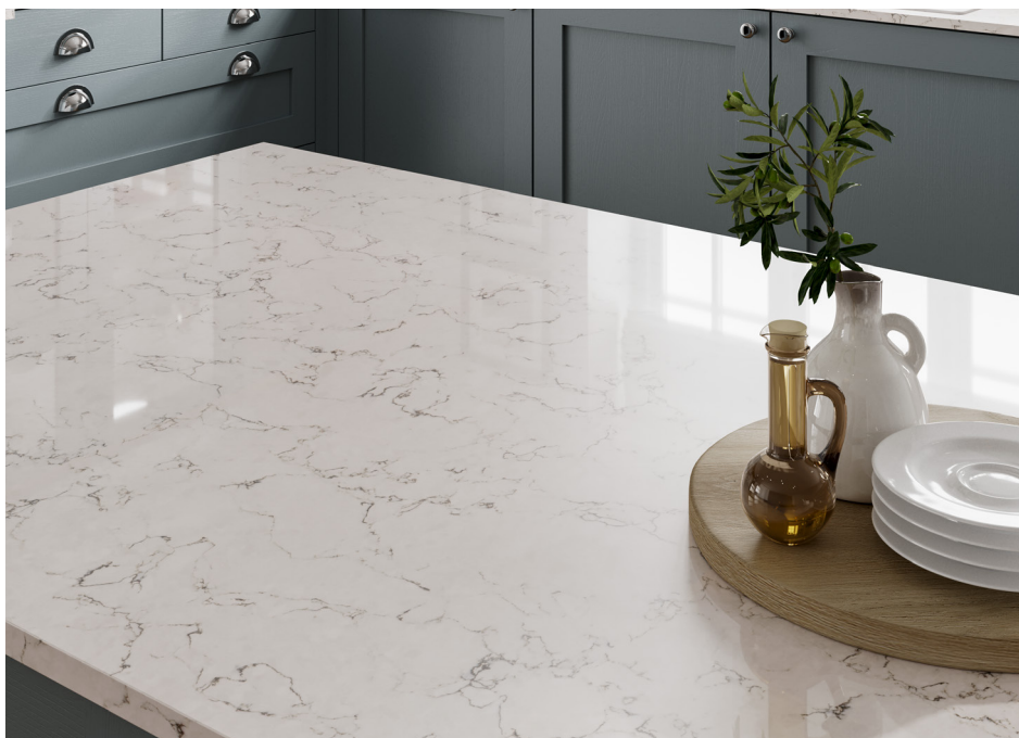
Calacatta Marble Laminated Worktop