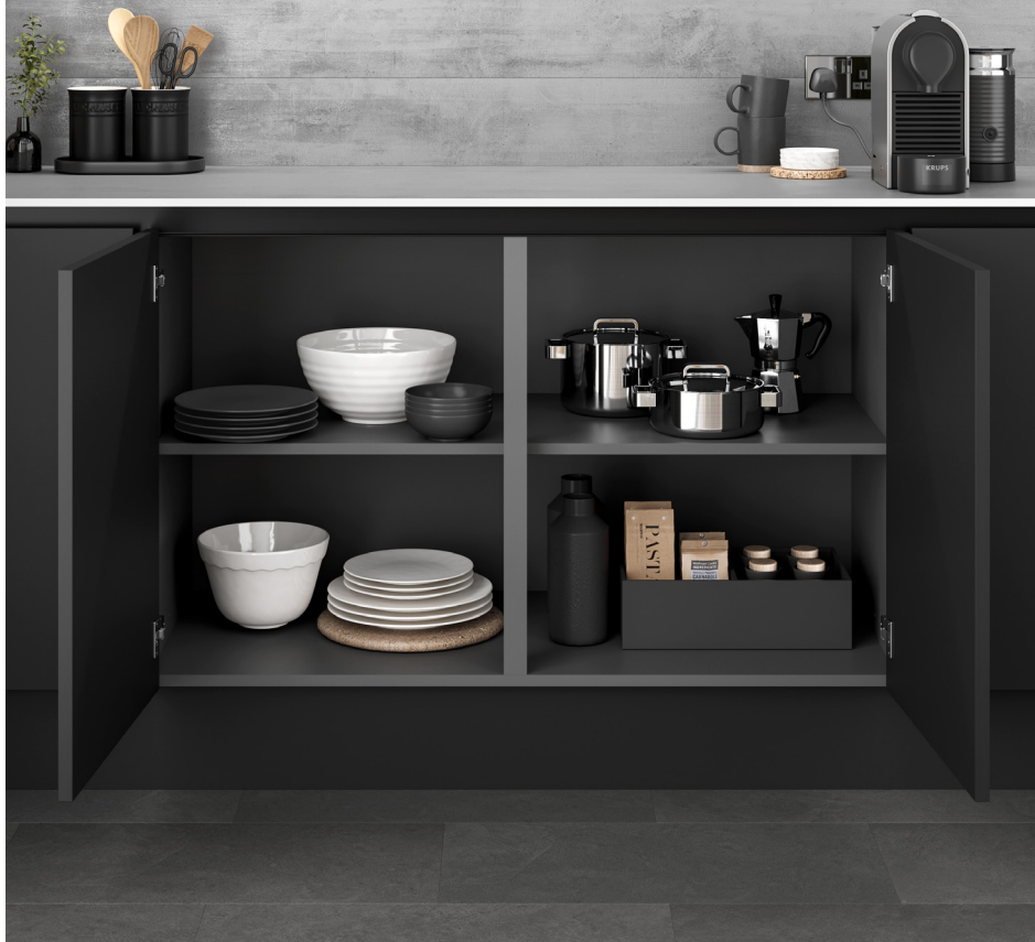
Slate Grey Handleless Cabinet with Hockley Super Matt Charcoal Handleless