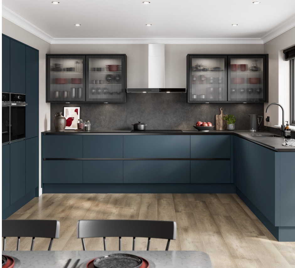
Hockley Super Matt Marine Blue Handleless